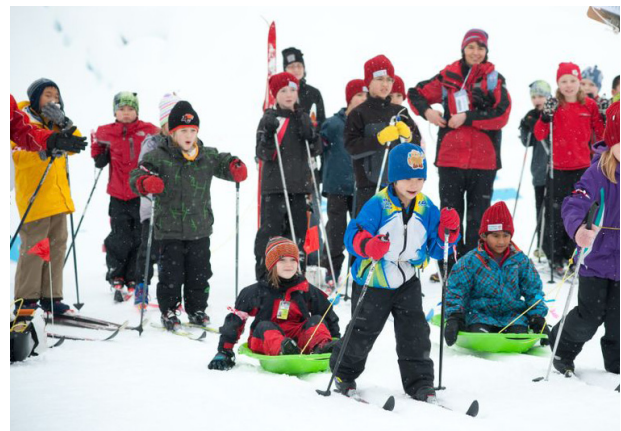
Kids showing the true spirit of fun competition in the kids' tournament.