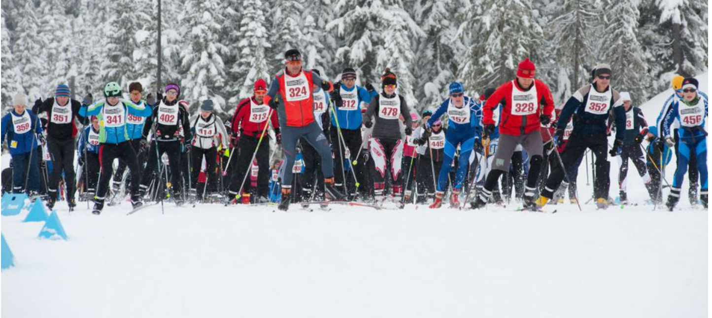
Racers head out onto the snowy course at the start of the second annual Sigge's Payak.