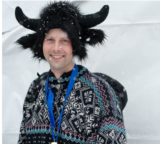
This viking knows how to have fun!

According to government statistics, 1.5 million people strap on the skinny skis every year. That is twice as many as play hockey! Nordic skiing remains