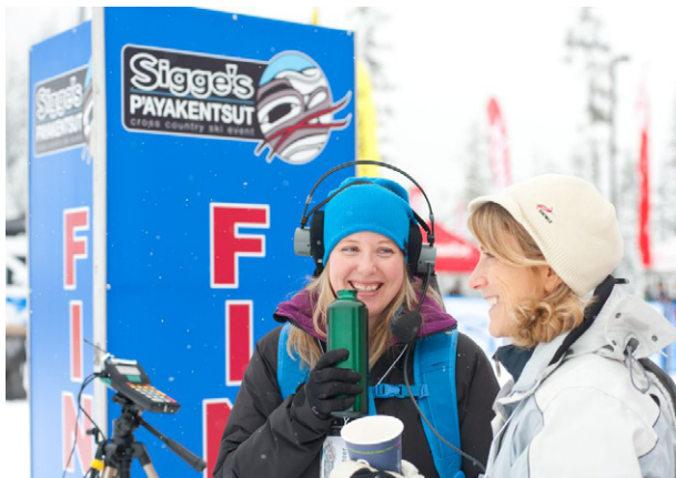
Volunteers enjoy a laugh at the finish line

As the event grows internationally over the coming years, the economic benefits will increase accordingly.